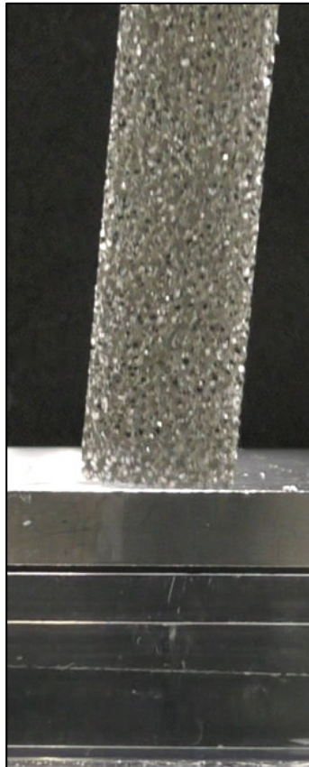
Normal porous plate